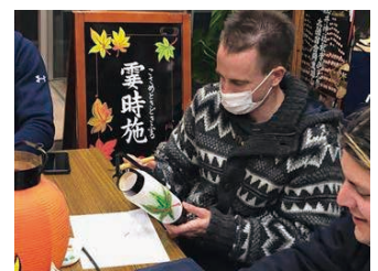
Lantern painting experience