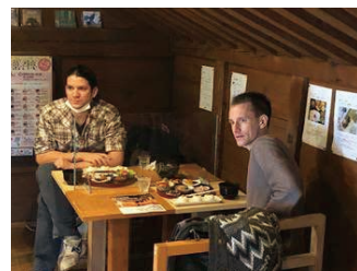
Lunch at Kura-cafe Sennohana