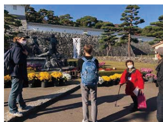
Kasumigajo Castle Park