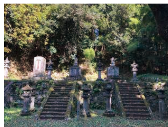
Learn the history in Dairin-ji temple