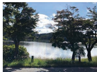
Walking in Nanko Park