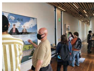
Komine Castle Historical Museum