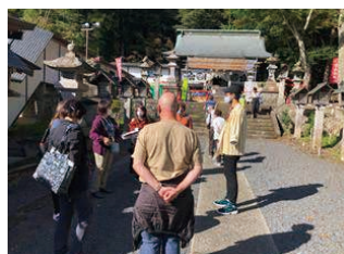
Visit and worship to the Nanko shrine