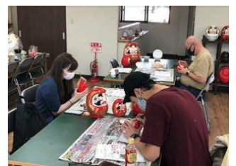
Daruma doll painting experience