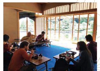
Lunch while looking at the garden