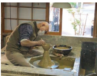
Demonstration by Munakata-gama 8th owner