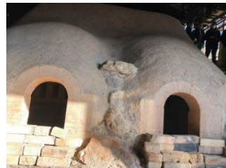
Nobori-gama (climbing kiln)