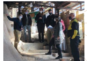
Explanation of the Nobori-gama (climbing kiln)