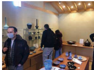
Visit to the gallery of Munakata-gama (kiln)