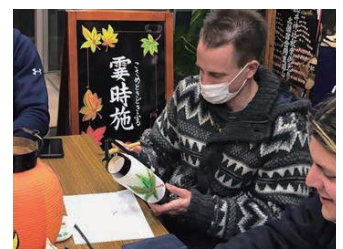
Lantern painting experience