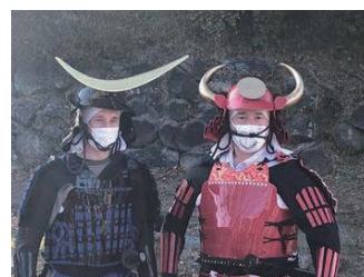
Experience wearing armor