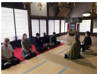
Zazen meditation experience at Ryusenji Temple