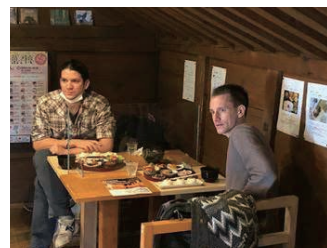
Lunch at Kura-cafe Sennohana