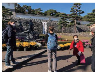
Kasumigajo Castle Park