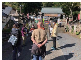
Visit and worship to the Nanko shrine