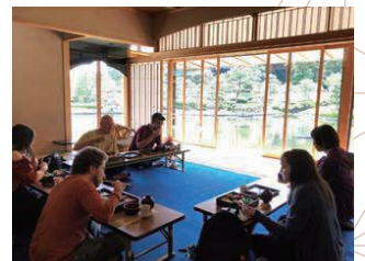
Lunch while looking at the garden