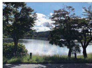
Walking in Nanko Park