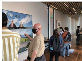
Komine Castle Historical Museum