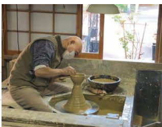
Demonstration by Munakata-gama 8th owner